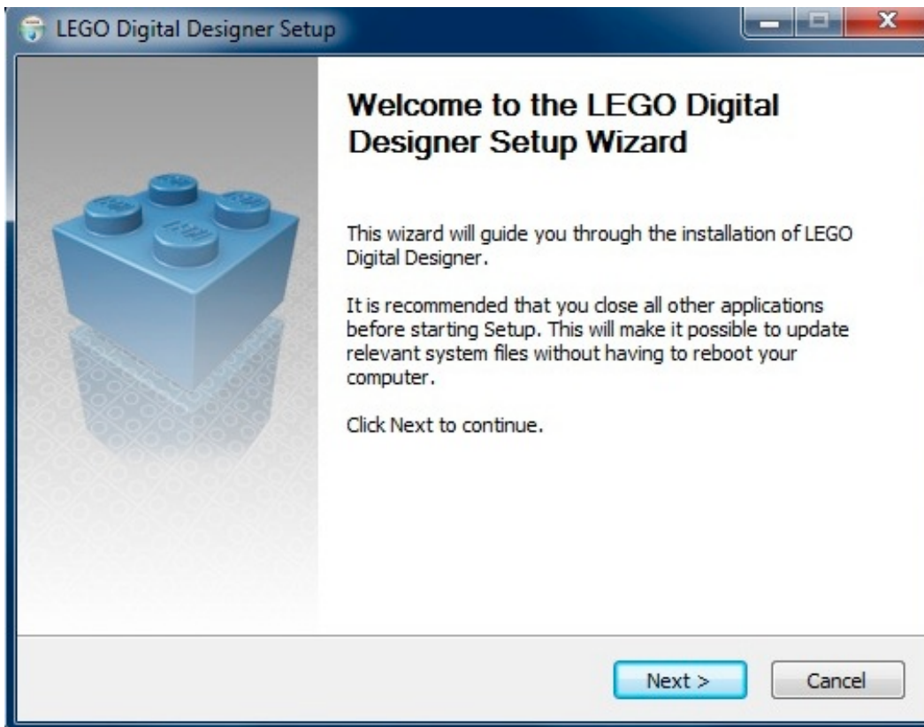
The Lego Digital Designer Installer

Press next then check the I accept the terms of the license agreement check box and press next three times then click Install.